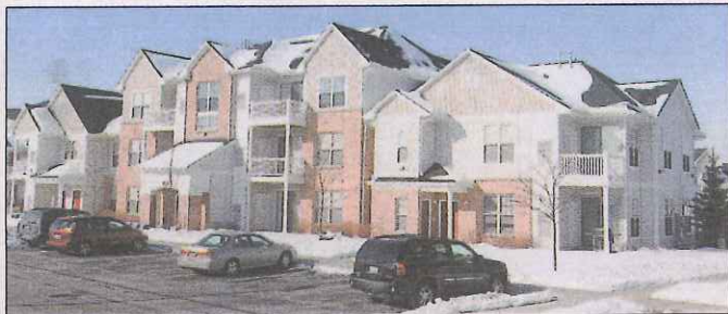
Coventry Glen Apartments at Valley Lakes in northwest suburban Round Lake have 280 units in 14 buildings. Individual garage spaces also are available.

Coventry Glen Apartments at Valley Lakes rests on a well-maintained landscape and features 280 apartments in 14 buildings. Rents for 1-bedroom apartments range from $700 to